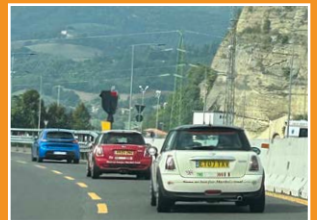
Our very own 'Italian job'!