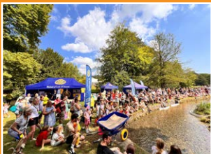
Dover Rotary Club duck race